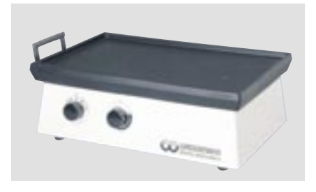
KV-56 plastic-powder-coated cast housing

KV-16, KV-26 plus, KV-36 stainless steel version matt