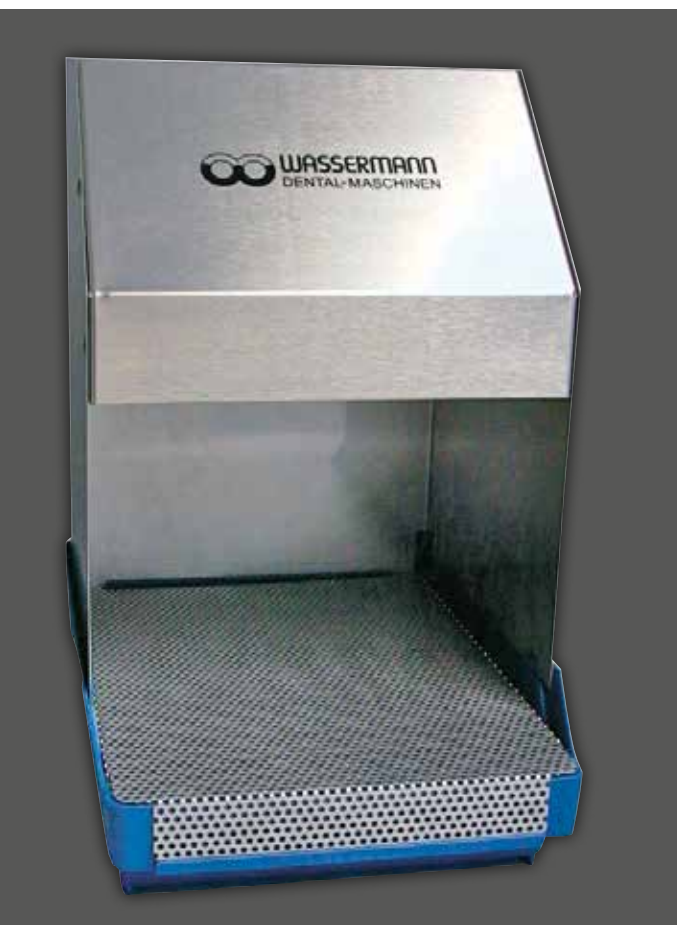
Splash protection made of stainless steel with plastic basement, available as accessory