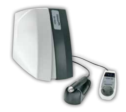
HSM-40 Knee control unit, basic equipment