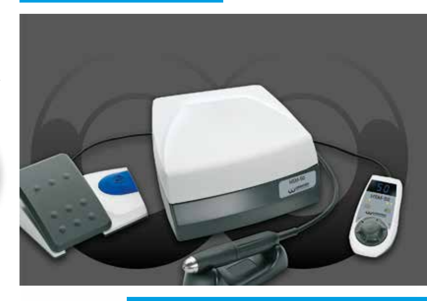
Laboratory Technology Machines