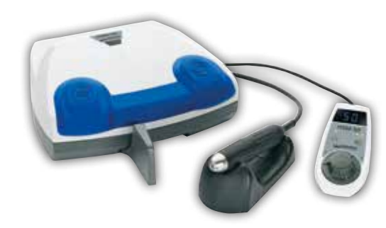
HSM-50 Foot control unit with accessory operating controls