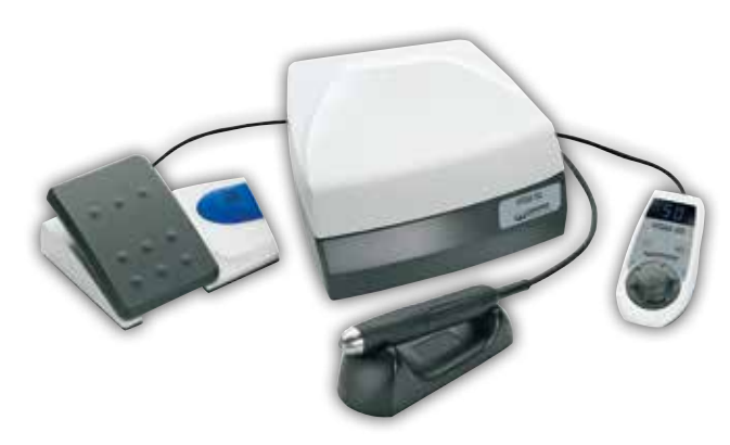
HSM-50 Table control unit, basic equipment