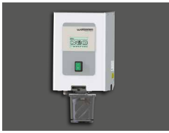
Wamix-Touch / Wamix-Touch Injector, wall fastening

Wamix-Touch Injector: It is extremely well-suited for mixing gypsums. Vacuum is achieved rapidly with this process even for large volumes, thus saving time. Another advantage is the robustness of the maintenance-free vacuum generator. Compressed air supply is required.