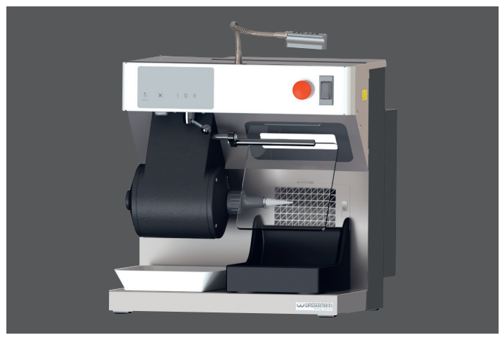
WP-Ex 10 II with special accessory daylight LED spot