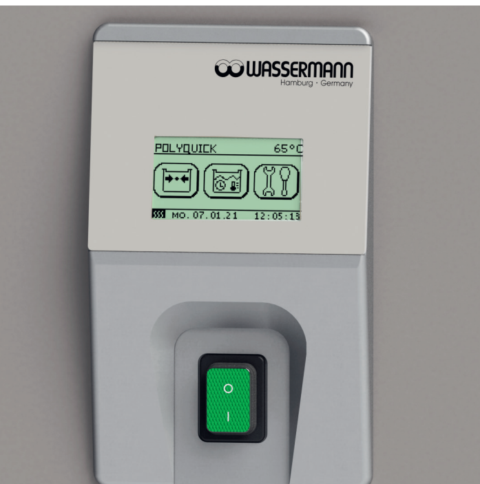
Self-explanatory symbols, fast and easy operation